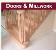
DOORS & MILLWORK